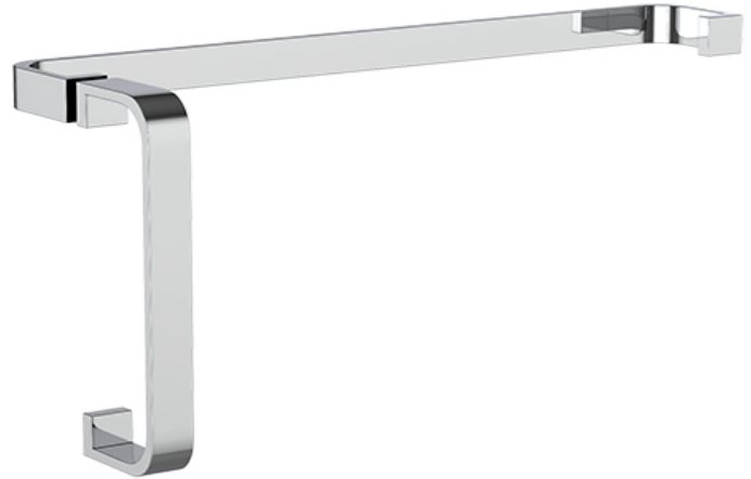
Offset Door Handle